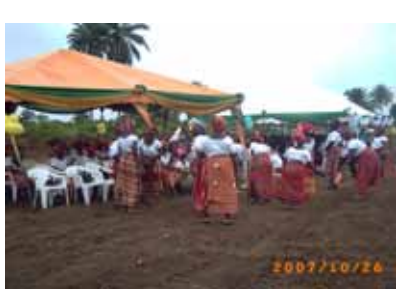
Rumuosi women dancing group