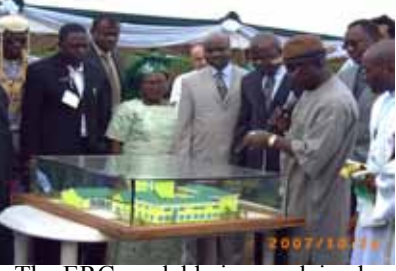
The ERC model being explained