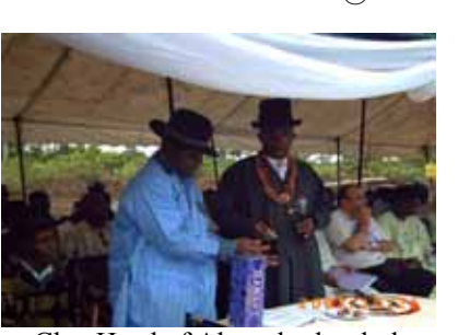
Clan Head of Akpor brakes kola